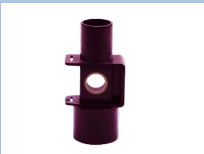
Repeatable Airway Adapter for Children