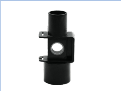
Repeatable airway adapter for adult