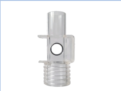
Disposable airway adapter for adult