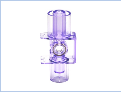
Disposable airway adapter for children